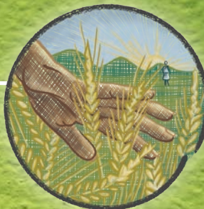
RUTH AND BOAZ A glimpse of God’s love in the midst of dark times.