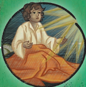
SAMUEL HEARS Samuel hears from God.

Now the young man Samuel was ministering to the LORD under Eli. And the word of the LORD was rare in those days; there was no frequent vision. At that time Eli, whose eyesight had begun to grow dim so that he could not see, was lying down in his own place. The lamp of God had not yet gone out, and Samuel was lying down in the temple of the LORD, where the ark of God was. Then the LORD called Samuel, and he said, "Here I am!" and ran to Eli and said, "Here I am, for you called me." But he said, "I did not call; lie down again." So he went and lay down. And the LORD called again, "Samuel!" and Samuel arose and went to Eli and said, "Here I am, for you called me." But he said, "I did not call, my son; lie down again." Now Samuel did not yet know the LORD, and the word of the LORD had not yet been revealed to him. And the LORD called Samuel again the third time. And he arose and went to Eli and said, "Here I am, for you called me." Then Eli perceived that the LORD was calling the young man. Therefore Eli said to Samuel, "Go, lie down, and if he calls you, you shall say, 'Speak, LORD, for your servant hears.'" So Samuel went and lay down in his place. And the LORD came and stood, calling as at other times, "Samuel! Samuel!" And Samuel said, "Speak, for your servant hears."