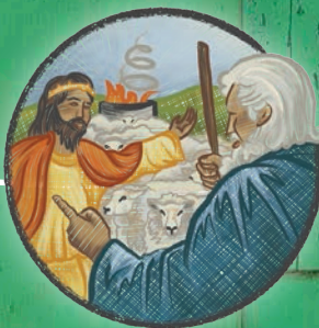
SAUL'S DOWNFALL Israel's first king fails to obey God.

Samuel lay until morning; then he opened the doors of the house of the LORD. And Samuel was afraid to tell the vision to Eli. But Eli called Samuel and said, "Samuel, my son." And he said, "Here I am." And Eli said, "What was it that he told you? Do not hide it from me. May God do so to you and more also if you hide anything from me of all that he told you." So Samuel told him everything and hid nothing from him. And he said, "It is the LORD. Let him do what seems good to him."