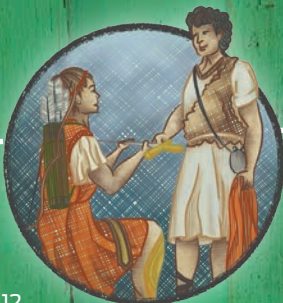
DAVID AND JONATHAN The gift of true friendship.

Because of the vast difference between God’s wisdom and ours, and because of humanity’s sinful state, human beings are incapable, on our own, of fully grasping spiritual truth without being aided by the Holy Spirit through the process of illumination. When it comes to understanding the meaning of God’s Word, Christians do not ultimately rely upon human reason in the process of interpretation, nor do we rely solely upon an institution or body of scholars. Instead, a Christian’s ultimate reliance is upon the work of the Spirit of God who illuminates the Scriptures in the heart and mind (Matt. 13:13-15; Mark 8:18).