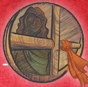
THE BATTLE OF JERICO Rahab helps the Israelites in their conquest of Jericho.