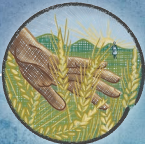
RUTH AND BOAZ A glimpse of God's love in the midst of dark times.

What Israel needed is the same as what you and I need today—not a temporary deliverer but a Savior who would change their hearts. The good news for us is that in the person of Jesus Christ, God is both our great Judge and our great Savior. In Christ, we are set free from these continuing patterns of sin and destruction so that we are also free to carry out God's mission in the world. As believers, we know that Christ has redeemed us from this endless cycle of sin and despair. So when we struggle with remaining sin, we are to confess quickly (Jas. 5:16) in light of God's patience (2 Pet. 3:9). His kindness toward us is what shows us His loving heart—even in the times He disciplines us and calls us back to Himself.