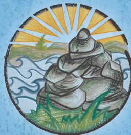
THE PARTING OF THE JORDAN God calls Joshua to lead His people.