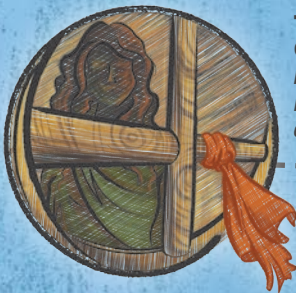
THE BATTLE OF JERICO Rahab helps the Israelites in their conquest of Jericho.

And as Moses lifted up the serpent in the wilderness, so must the Son of Man be lifted up, that whoever believes in him may have eternal life.