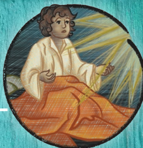
SAMUEL HEARS Samuel hears from God.