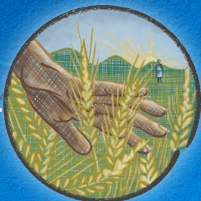
RUTH AND BOAZ A glimpse of God's love in the midst of dark times.

But Elimelech, the husband of Naomi, died, and she was left with her two sons. These took Moabite wives; the name of the one was Orpah and the name of the other Ruth. They lived there about ten years, and both Mahlon and Chilion died, so that the woman was left without her two sons and her husband.