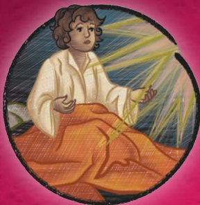
SAMUEL HEARS Samuel hears from God.

The Spirit's work in the life of a Christian begins with salvation, bringing a person to faith in Christ, and is continued through the process of sanctification, helping that person become more like Christ throughout the course of his or her life. The Spirit empowers and indwells believers, intercedes on their behalf, and equips them with special gifts for service in God's kingdom. He is also our Comforter and Teacher, helping us to interpret and understand Scripture.