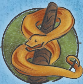
THE BRONZE SERPENT The people look and are healed.

From Mount Hor they set out by the way to the Red Sea, to go around the land of Edom. And the people became impatient on the way. And the people spoke against God and against Moses, "Why have you brought us up out of Egypt to die in the wilderness? For there is no food and no water, and we loathe this worthless food." Then the LORD sent fiery serpents among the people, and they bit the people, so that many people of Israel died. And the people came to Moses and said, "We have sinned, for we have spoken against the LORD and against you. Pray to the LORD, that he take away the serpents from us." So Moses prayed for the people. And the LORD said to Moses, "Make a fiery serpent and set it on a pole, and everyone who is bitten, when he sees it, shall live." So Moses made a bronze serpent and set it on a pole. And if a serpent bit anyone, he would look at the bronze serpent and live.