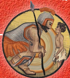
THE ANOINTING OF DAVID The characteristics of a true king.