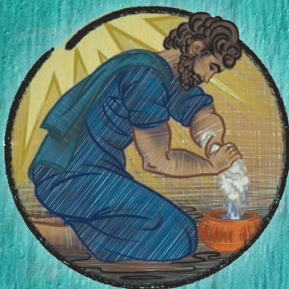
GIDEON God gives strength to accomplish His will.

Now the angel of the LORD came and sat under the terebinth at Ophrah, which belonged to Joash the Abiezrite, while his son Gideon was beating out wheat in the winepress to hide it from the Midianites. And the angel of the LORD appeared to him and said to him, "The LORD is with you, O mighty man of valor." And Gideon said to him, "Please, sir, if the LORD is with us, why then has all this happened to us? And where are all his wonderful deeds that our fathers recounted to us, saying, 'Did not the LORD bring us up from Egypt?' But now the LORD has forsaken us and given us into the hand of Midian." And the LORD turned to him and said, "Go in this might of yours and save Israel from the hand of Midian; do not I send you?" And he said to him, "Please, Lord, how can I save Israel? Behold, my clan is the weakest in Manasseh, and I am the least in my father's house." And the LORD said to him, "But I will be with you, and you shall strike the Midianites as one man."