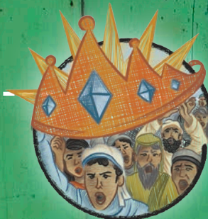
DEMAND FOR A KING* The people desire to be like the surrounding nations. *Beginning Summer 2016