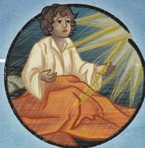
SAMUEL HEARS Samuel hears from God.