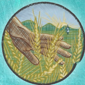
RUTH AND BOAZ A glimpse of God's love in the midst of dark times.

The victory of Israel over Midian is one of the most extraordinary battle accounts in the Old Testament. In Judges 7:1-8, God pared the army from 32,000 to 300 men. God insisted that His people see their cause as utterly hopeless, so that they would recognize that their deliverance could only be chalked up to God's power and mercy. Along the way, God continued to reassure Gideon. And finally, Gideon worshipped God as a sign of his faith and trust in God to accomplish His will through him.