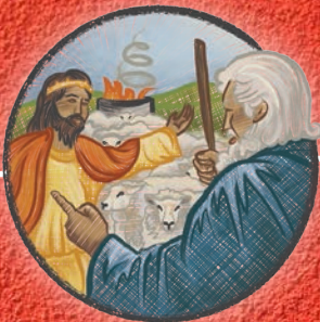
SAUL'S DOWNFALL Israel's first king fails to obey God.

Jesus is greater than Samson. He is the Judge who would never break his word, the Judge who would never operate out of impulse or for self-gratification, but only do what the Father did. And in His death, many—including us—would become sons and daughters of God.