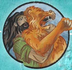
SAMSON God uses broken leaders to accomplish His good purposes.