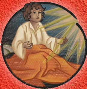
SAMUEL HEARS Samuel hears from God.

Now the house was full of men and women. All the lords of the Philistines were there, and on the roof there were about 3,000 men and women, who looked on while Samson entertained. Then Samson called to the LORD and said, "O Lord God, please remember me and please strengthen me only this once, O God, that I may be avenged on the Philistines for my two eyes." And Samson grasped the two middle pillars on which the house rested, and he leaned his weight against them, his right hand on the one and his left hand on the other. And Samson said, "Let me die with the Philistines." Then he bowed with all his strength, and the house fell upon the lords and upon all the people who were in it. So the dead whom he killed at his death were more than those whom he had killed during his life.