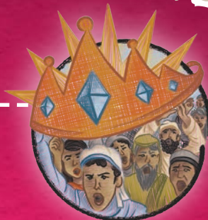
DEMAND FOR A KING* The people desire to be like the surrounding nations. *Beginning Summer 2016