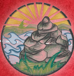
THE PARTING OF THE JORDAN God calls Joshua to lead His people.

Then all the congregation raised a loud cry, and the people wept that night. And all the people of Israel grumbled against Moses and Aaron. The whole congregation said to them, "Would that we had died in the land of Egypt! Or would that we had died in this wilderness! Why is the LORD bringing us into this land, to fall by the sword? Our wives and our little ones will become a prey. Would it not be better for us to go back to Egypt?" And they said to one another, "Let us choose a leader and go back to Egypt."