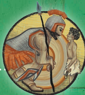
THE ANOINTING OF DAVID The characteristics of a true king.