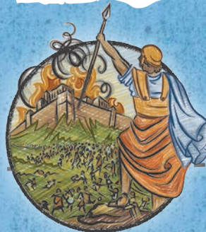
CONQUEST OF ACHAN How one man's sin can negatively affect everyone around him.