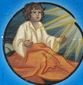
SAMUEL HEARS Samuel hears from God.