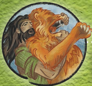
SAMSON God uses broken leaders to accomplish His good purposes.

Justification is not the result of human effort or good works, but of faith in the righteousness of Christ. Although good works do not lead to justification, justification leads to good works in the life of a believer (Eph. 2:10). Faith without works is dead (Jas. 2:17). While good works do not establish justification, they do verify a genuine faith and make our justification evident to others.