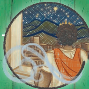
THE DAVIDIC COVENANT God reestablishes the covenant with David and his descendants.